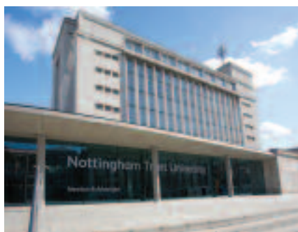
Clockwise from top left: York House, the Psychology labs, the redeveloped Newton building, and its fabulous new learning environment.