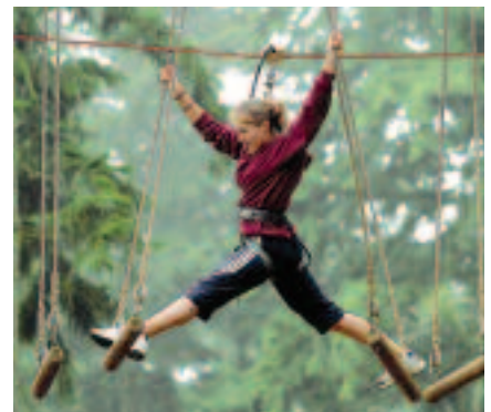
Enjoy discounts at Go Ape! with your Venture card

And, for a full run-down of the many exciting benefits and services you can enjoy, including those on offer through your venture card, just visit www.ntualumni.org.uk