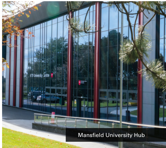
Mansfield University Hub