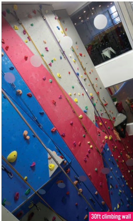
30ft climbing wall