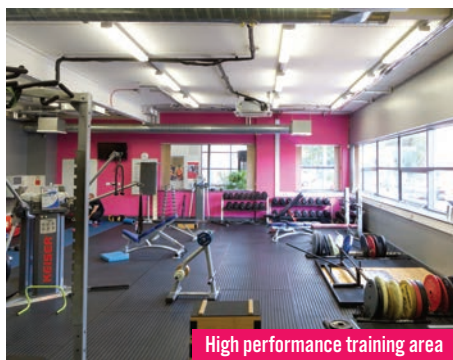
High performance training area