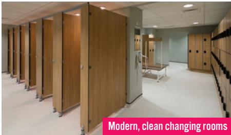
Modern, clean changing rooms