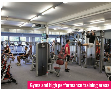
Gyms and high performance training areas