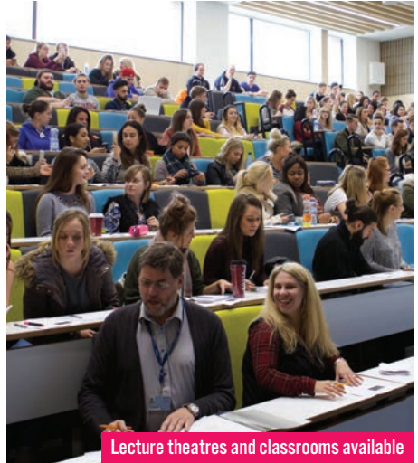
Lecture theatres and classrooms available