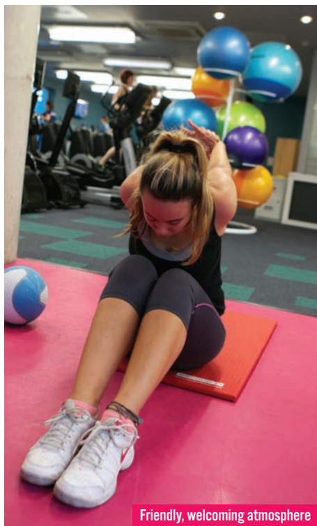
Friendly, welcoming atmosphere