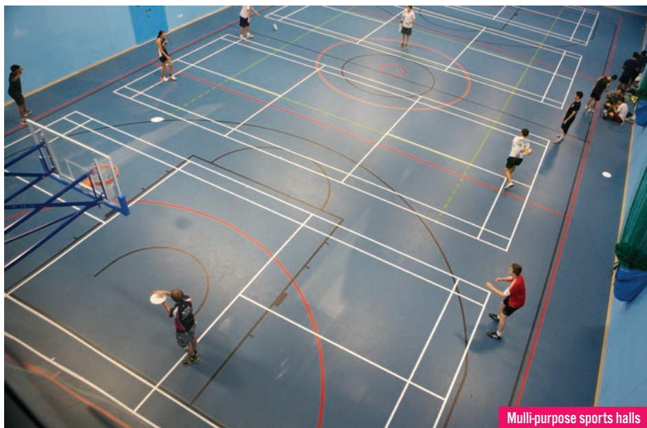
Multi-purpose sports halls