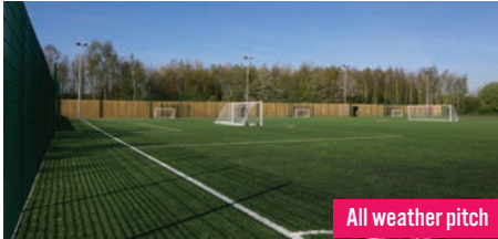
All weather pitch

There are a variety of AV equipped meeting rooms and lecture theatres available at each campus. Both of our sporting areas also have male, female and disabled changing facilities, as well as sporting equipment for a range of different sports.