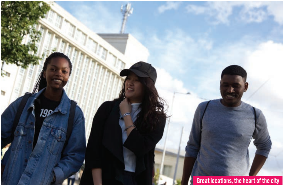
Great locations, the heart of the city