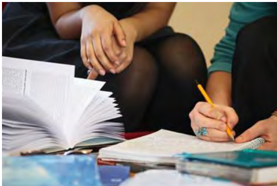
Better tutorial support