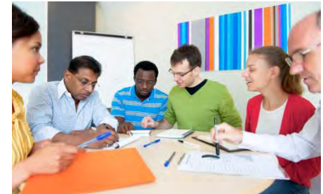
PG student area only