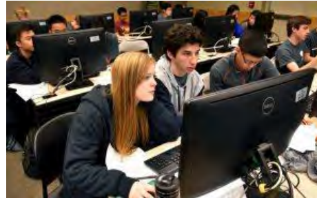
24hrs access to MAC computers