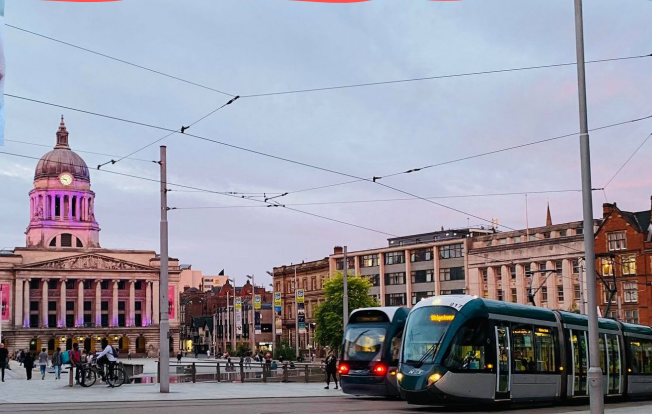
Nottingham City Centre, Old Market Square