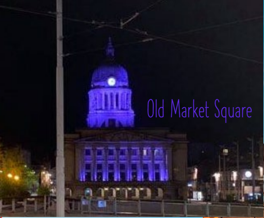
Old Market Square