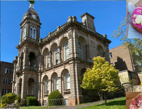
NTU Waverley Building