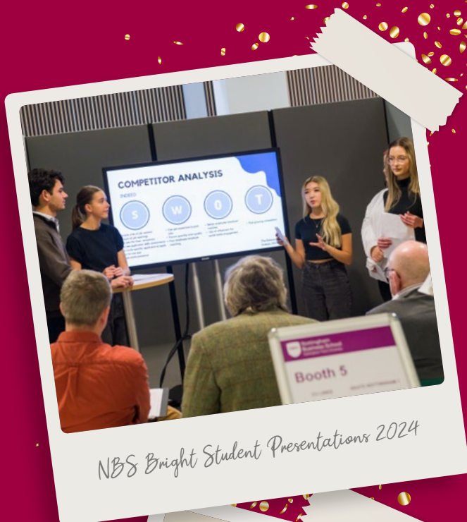
NBS Bright Student Presentations 2024

"I have benefitted greatly from the mentorship so far. Having open conversations and being able to learn from someone in a position I aspire to is incredibly inspiring. With the guidance I'm receiving, I know that achieving similar success to that of my mentor is possible."