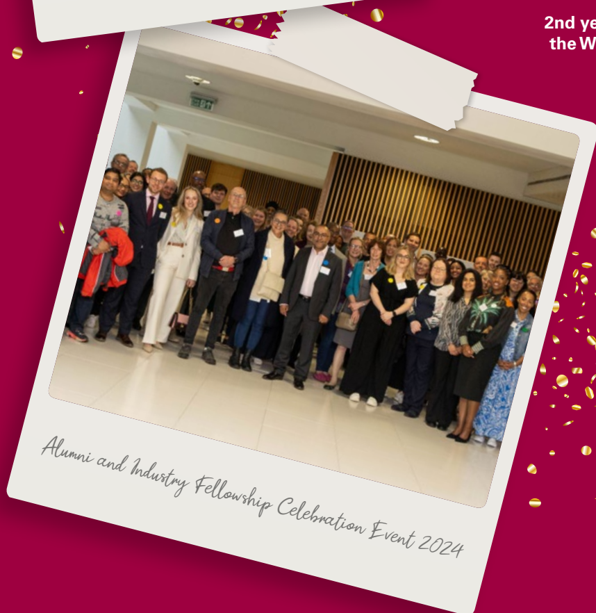
Alumni and Industry Fellowship Celebration Event 2024

2nd year BSc Product Design student on the Women's Development Programme