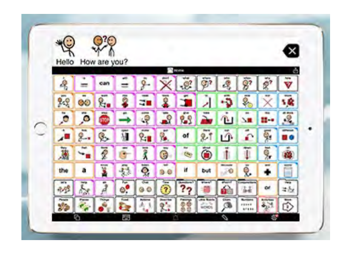
AAC apps for iPad