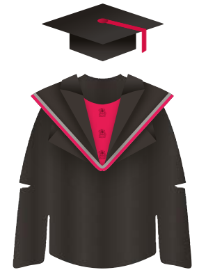
Postgraduate Certificate | Diploma