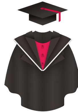
Undergraduate Certificate | Diploma | Foundation