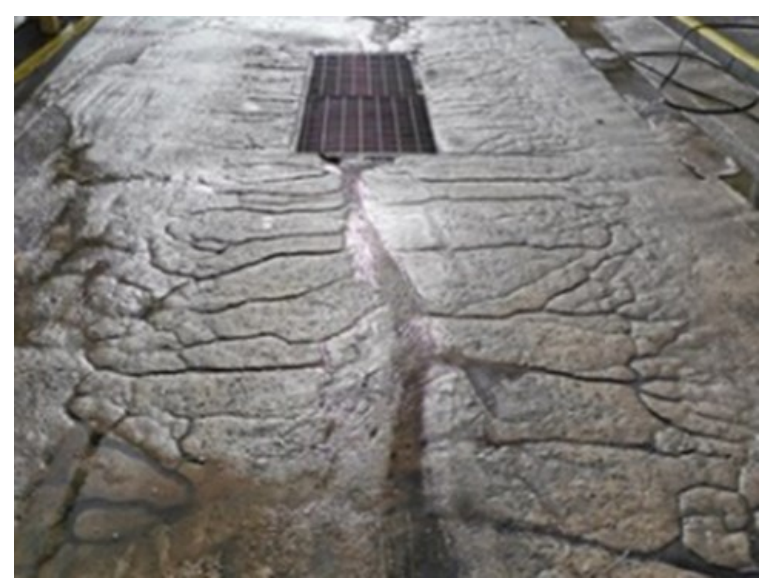
Figure 1. Purpose made water drainage by the petrol station. Surface has been degraded by chemicals