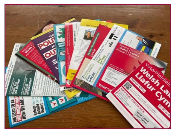
Figure 2.A young person's election diary entry showing campaign leaflets

Perceptions of the quality and reach of the campaigns among young people varied between political parties, especially in relation to young people's political interests. Among focus group participants, Plaid Cymru and, to a lesser extent, Welsh Labour were viewed as having engaged to the most extent with young people and engaged with their issues when compared with other political parties. Particularly in Welsh-speaking areas such as Gwynedd, focus group participants perceived candidates, predominantly those of Plaid Cymru, as more interested in young people's opinions than elsewhere.