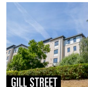
GILL STREET NORTH

Location: City, on campus Rooms: 446 Flat size: 4–8 people, or studio En suite: Yes Accessible accommodation: Yes